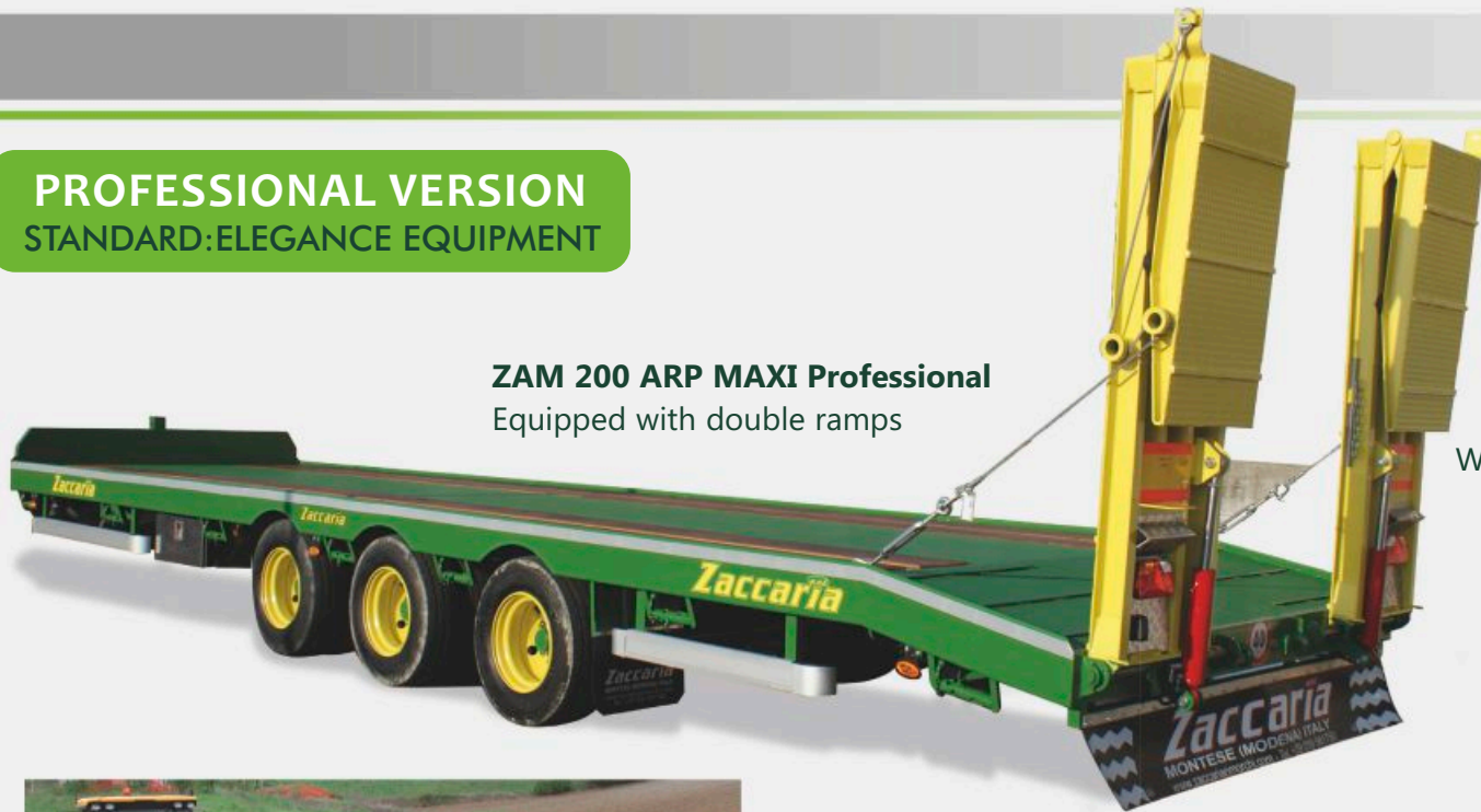
ZAM 200 ARP MAXI Professional Equipped with double ramps

PROFESSIONAL VERSION Oversized axles and structure for heavy loads. Wooden stripes on the loading platform New tyres 245/70 R 17.5