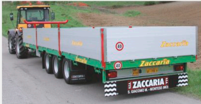
ZAM 200 ARP Professional equipped with aluminium sides

PROFESSIONAL VERSION Oversized axles and structure for heavy loads. Wooden stripes on the loading platform New tyres 245/70 R 17.5