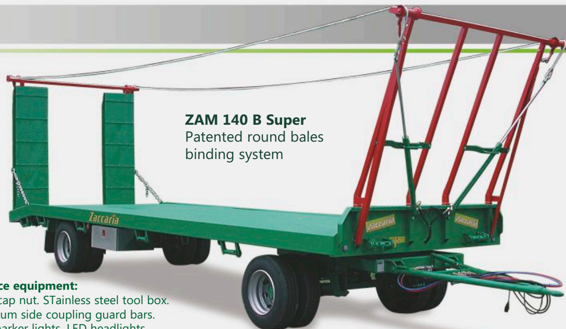
ZAM 140 B Super Patented round bales binding system

Front bar for round bales. Patented round bales binding system Poles for round bales support Hydraulic system for adjusting the ramps distance. Double ramps mm. 600x2000+1200 Wide ramps mm. 750x2200 (inside meas. 950÷520) Hydraulic winch. Special draw bar eye for export.