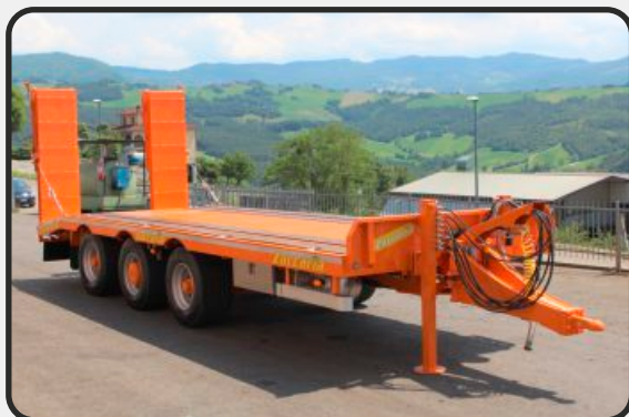
ZAM 200 ARP with hydraulic traction