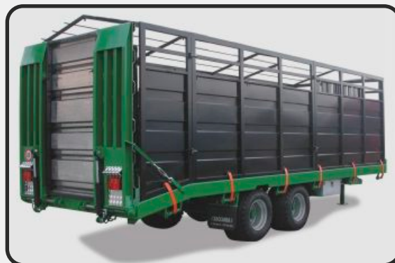
ZAM 140 P Super Outfitted for transporting live animals

Our technical department designs using calculation software and 3D drawing "Big trailers" equipment. A dedicated office tests Operating Machines and Oversize load vehicles, according to Italian and European standards.