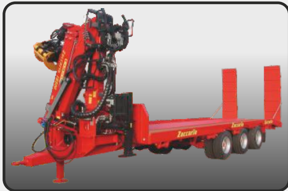
ZAM 200 ARP Professional with Zaccaria crane F8500.