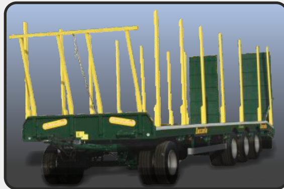
ZAM 200 P SUPER 4 AXLES VERSION Working capacity 40000 kg.