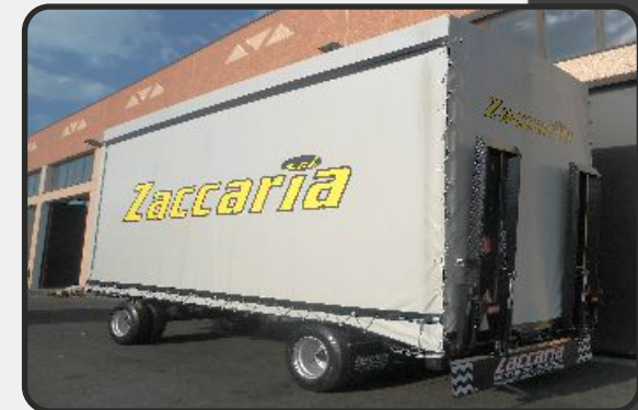
Trailer with coverings Various models and hydraulic ramps

Our technical department designs using calculation software and 3D drawing "Big trailers" equipment. A dedicated office tests Operating Machines and Oversize load vehicles, according to Italian and European standards.