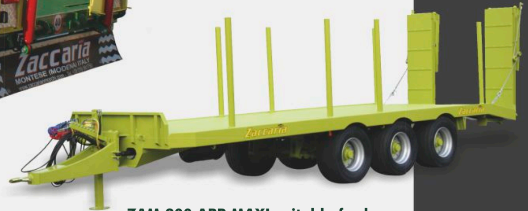
ZAM 200 ARP MAXI suitable for logs Equipped with double ramp and hydraulic steering drawbar