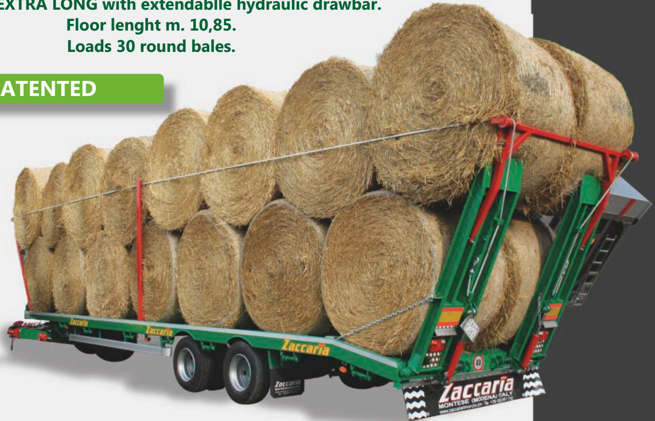
Extendable hydraulic drawbar