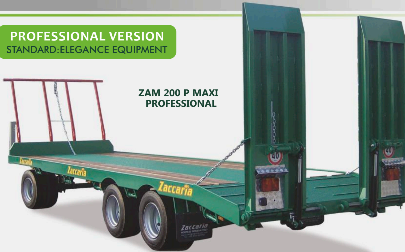
ZAM 200 P MAXI PROFESSIONAL

PROFESSIONAL VERSION Oversize axles and reinforced structure for special loads. Wooden stripes on platform. New 245/70 R 17.5 Pirelli tyres with reinforced rims.