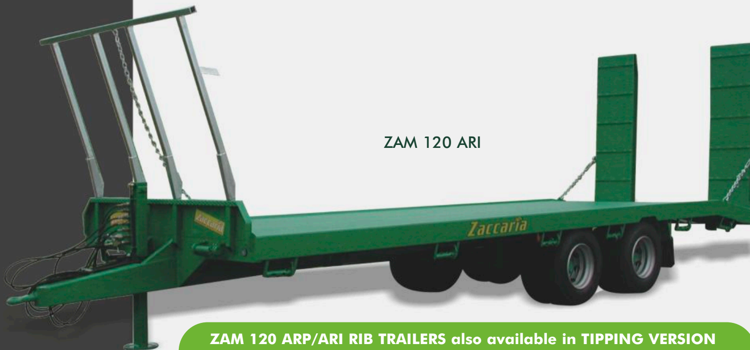
ZAM 120 ARI

ZAM 120 ARP/ARI RIB TRAILERS also available in TIPPING VERSION with rear loadingboard and cantilever spring suspensions.