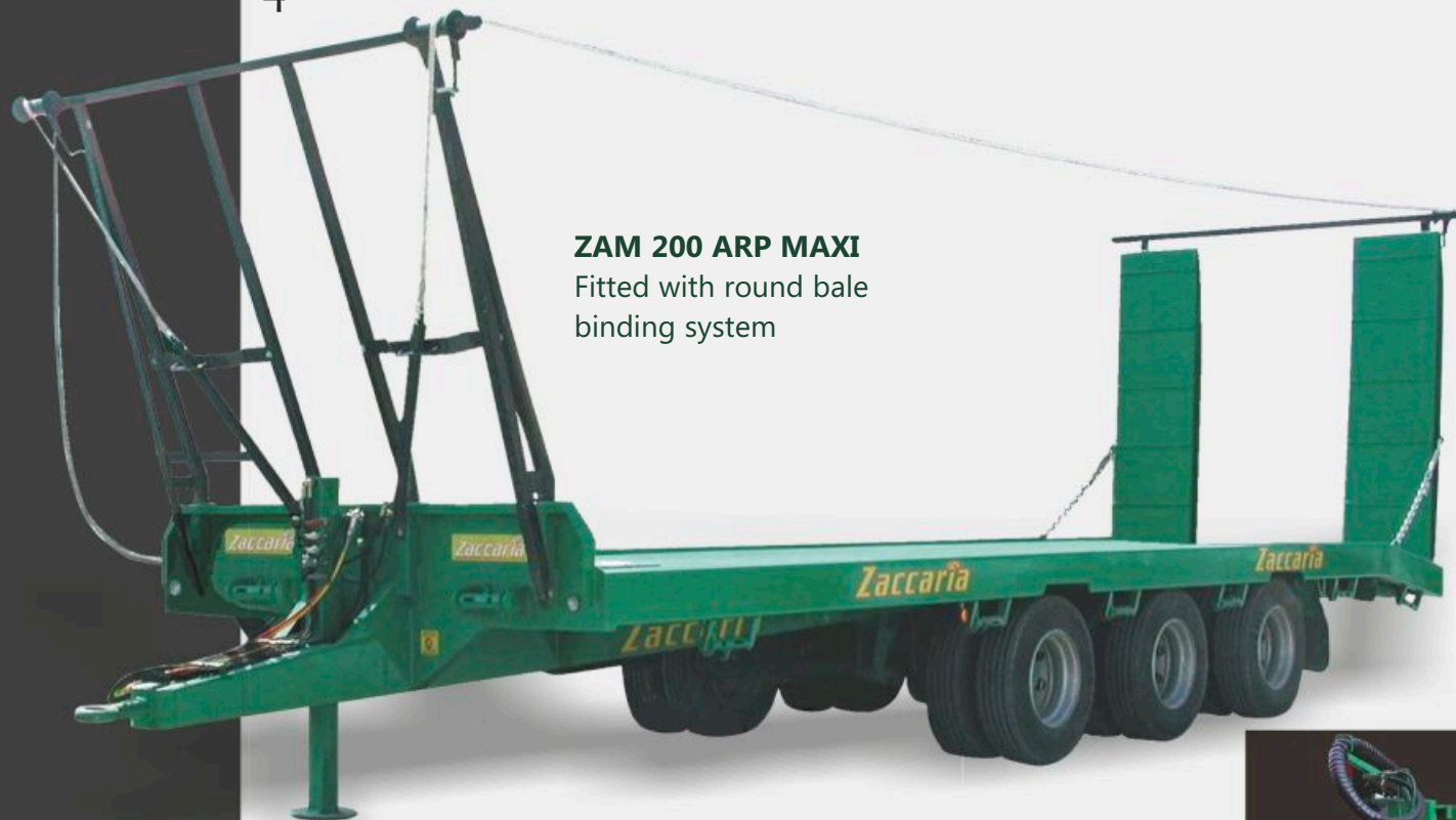
ZAM 200 ARP MAXI Fitted with round bale binding system

ON DEMAND: Ramp operation side distributor