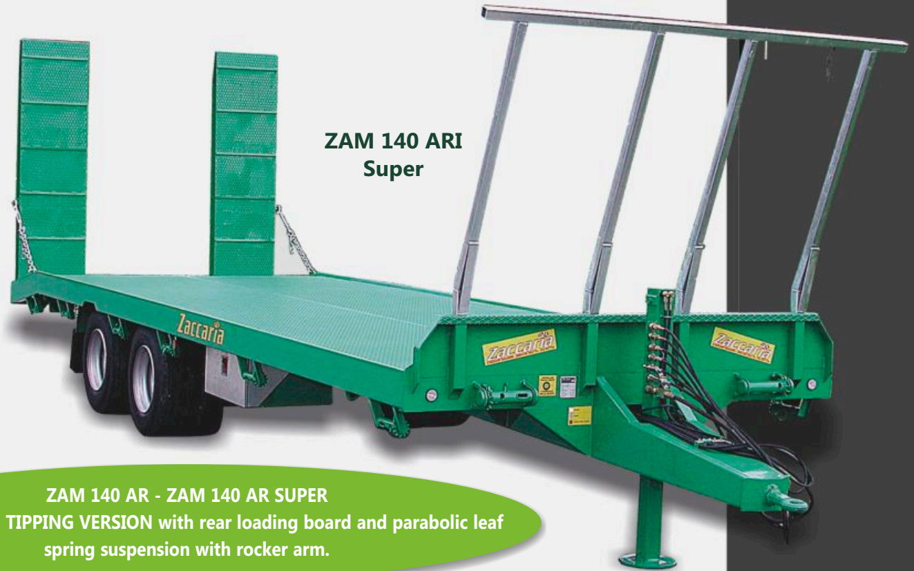
ZAM 140 ARI Super

ZAM 140 AR - ZAM 140 AR SUPER also available in TIPPING VERSION with rear loading board and parabolic leaf spring suspension with rocker arm.