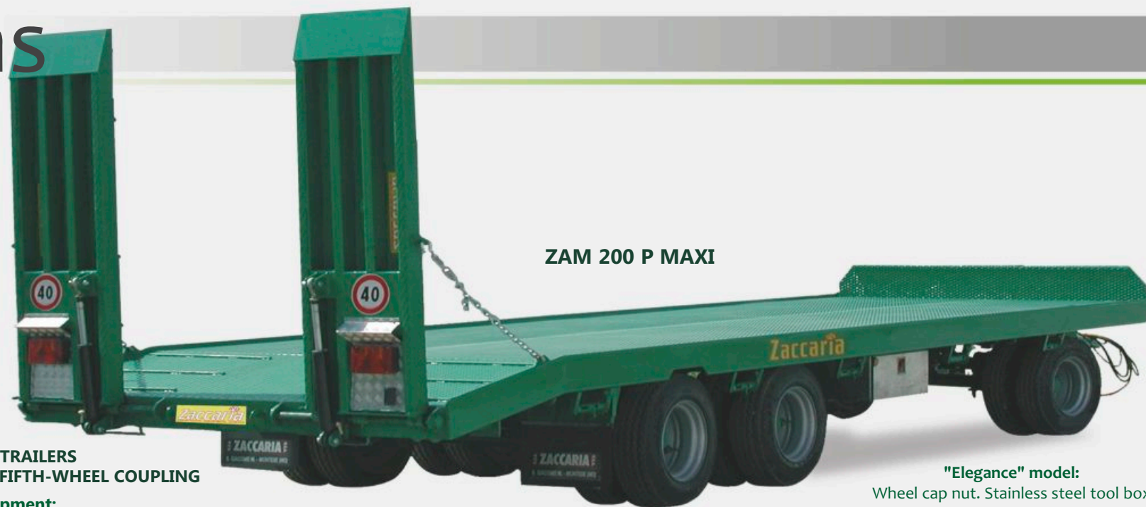
ZAM 200 P MAXI