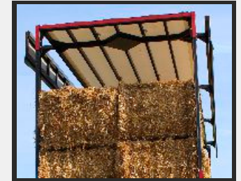
Round bales compression side extension.

3 height adjustable with PVC tarpaulin, side enlargements PVC covering with enlargable roof. Rear protection bar.