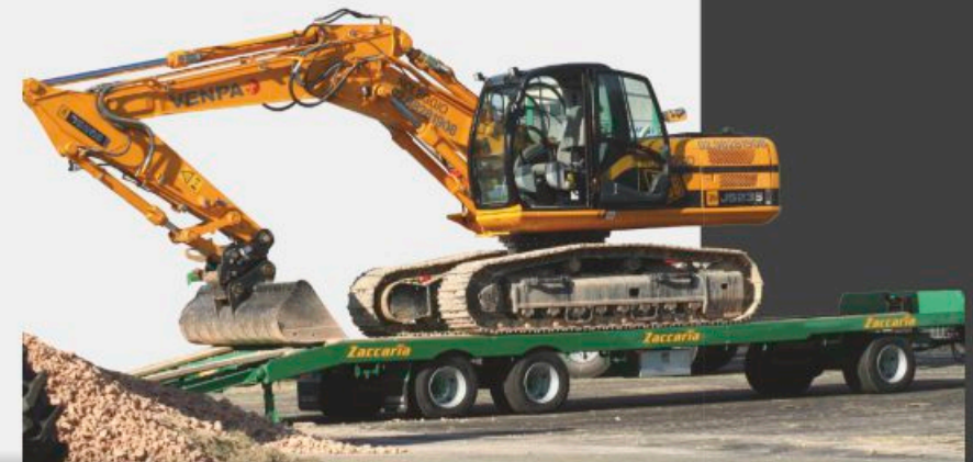
ZAM 200 I Maxi Professional

The maximum load capacity of trailers can be adapted in conformity with the regulations in force in your country.